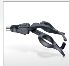
ERAGON axial handle with ratchet lock, not rotatable ..... 83930085