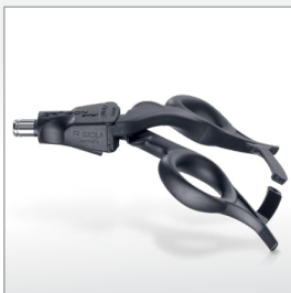
ERAGON axial handle with ratchet lock ..... 83930082

When ergonomic design and intuition come together