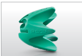
Option: Knob attachment ERAGON axial , autoclavable ..... 8988