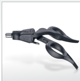
ERAGON axial handle without lock, with HF connector ..... 83930083