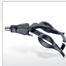
ERAGON axial handle with ratchet lock, with HF connector ..... 83930084